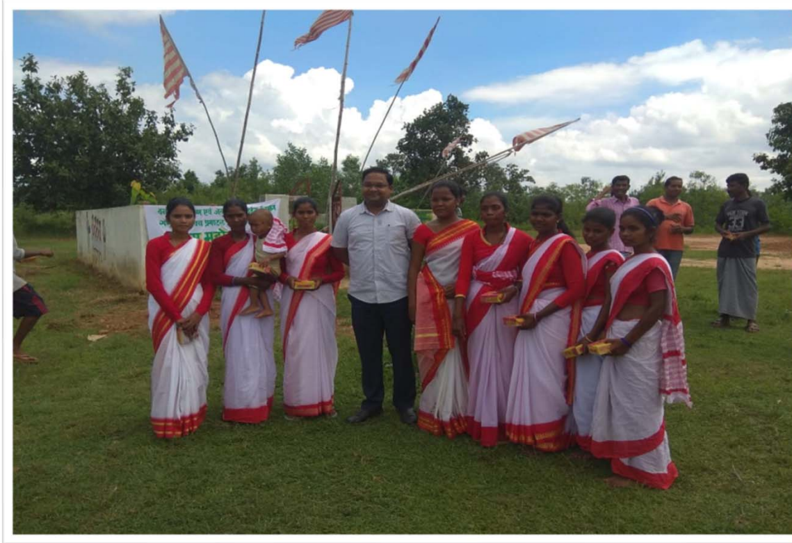
Celebration of Karam Mahotsav in Mosodih village of Kharsawan Range