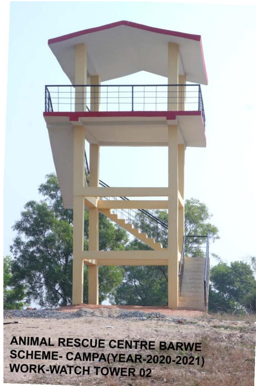
ANIMAL RESCUE CENTRE BARWE SCHEME- CAMPA(YEAR-2020-2021) WORK-WATCH TOWER 02