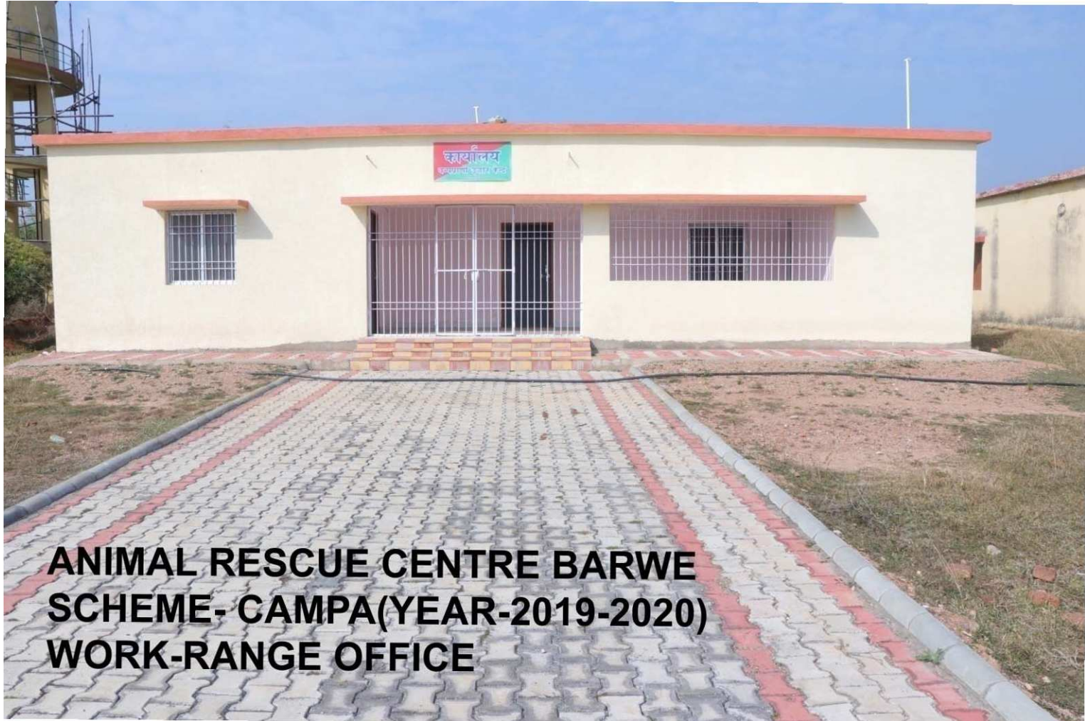
ANIMAL RESCUE CENTRE BARWE SCHEME- CAMPA(YEAR-2019-2020) WORK-RANGE OFFICE