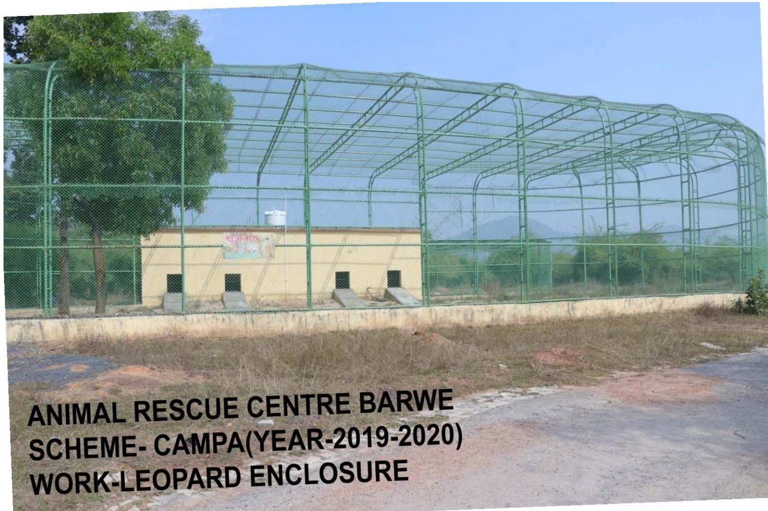
ANIMAL RESCUE CENTRE BARWE SCHEME- CAMPA(YEAR-2019-2020) WORK-LEOPARD ENCLOSURE